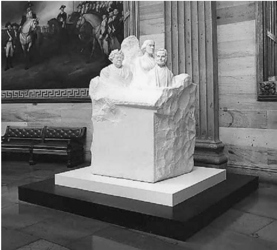
Figure 22.1 Portrait Monument to Lucretia Mott, Elizabeth Cady Stanton, and Susan B. Anthony, Architect of the Capitol.

champion of the rights of women, and according to Pence’s logic each was therefore also “prolife.”