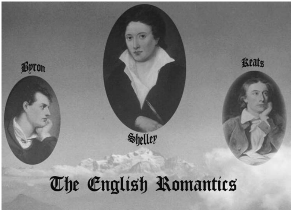
Figure 22.3 The English Romantic Poets, used with kind permission of James Sullivan of Ard Ri Design.

As though writers have replaced saints in their capacity to sanctify ground, regions become associated with their patrons and protectors, and literary history may be read as a travelogue: “From Robert Frost’s New England farms to John Steinbeck’s California valley to Eudora Welty’s Mississippi Delta” (Library of Congress 2004). An image of Irish writers, for example (Figure 22.4), appears as a prosopography upon a map (Sullivan 2004b). In this display as elsewhere, the writers seem so famous as to need no name, but they have a country and a cause. The flag and the harp signal the viewer to pursue tourism as well as reading to supply the memories for this prosopography.