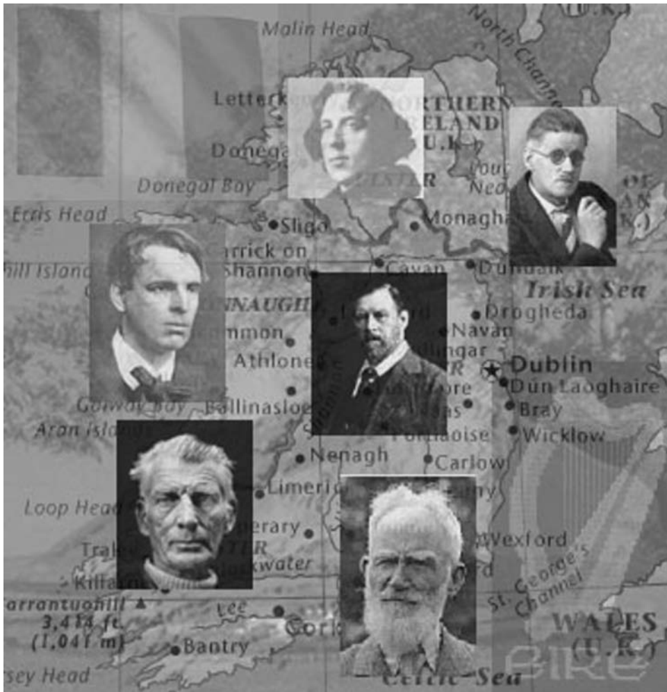
Figure 22.4 Irish Writers Montage, used with kind permission of James Sullivan of Ard Ri Design.

contests to entice readers (or the BBC audience and book buyers), including a series of weekly votes on pairs of famous novels, such as Bridget Jones's Diary and Pride and Prejudice (the latter preferred by 82%), or Brideshead Revisited and The Great Gatsby (the latter preferred by 54%). The link for “More About the Books and Authors” provides the necessary exhibit of personae: beside each novel’s cover and description, a portrait and three-sentence biography of each author. Such populist canon-building is not strictly national, but there are signs of the government’s effort to construct a citizenry of readers. The Lord of the Rings was recently elected winner of The Big Read: “the nation’s favourite book.” 7 The popular series of films of Tolkein’s novels may lead these British fans to seek Middle Earth in New Zealand. Anglophone culture has gone